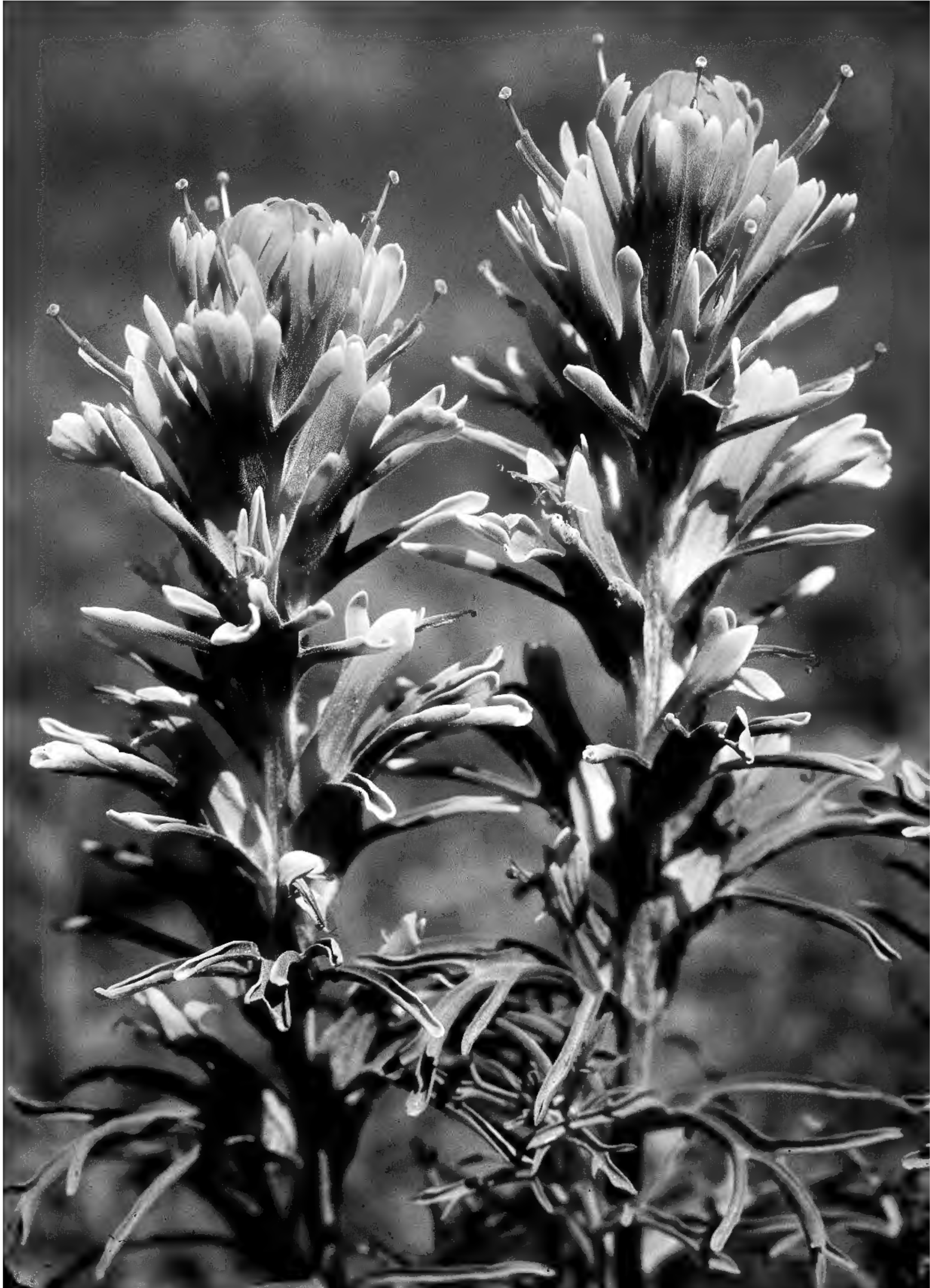
Figure 3. Castilleja purpurea in typical form. Ca. 3 miles east of Bangs, Brown Co., Texas, 20 Apr 1997.